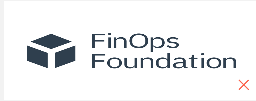
NEVER STRETCH OR SKEW

The logo should be used in a way that is easy to read and quickly communicate who you are. Alterations to the logo such as stretching, skewing, or rearranging the mark will dilute the brand.