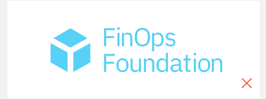
NEVER APPLY AN UNAPPROVED COLORS