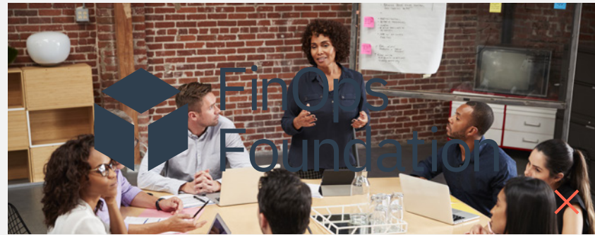
NEVER PLACE ON A BUSY BACKGROUND