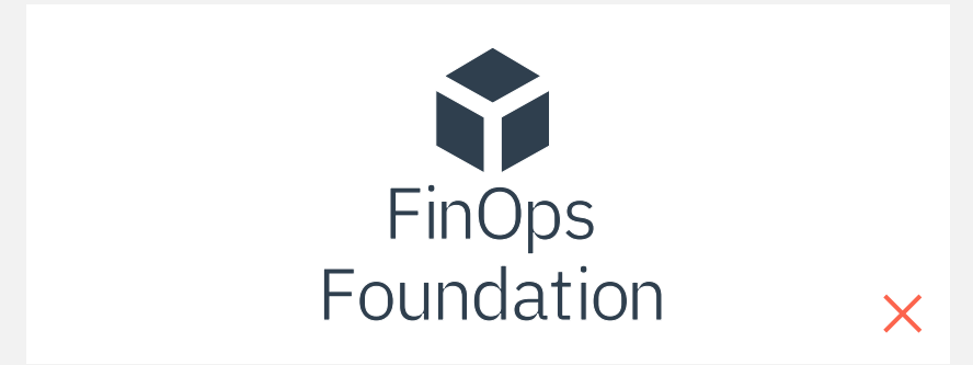
NEVER CHANGE THE LOCKUP