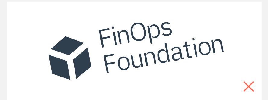
NEVER USE AT AN ANGLE