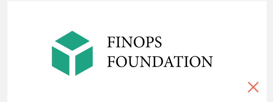
DON'T USE DIFFERENT TYPEFACES